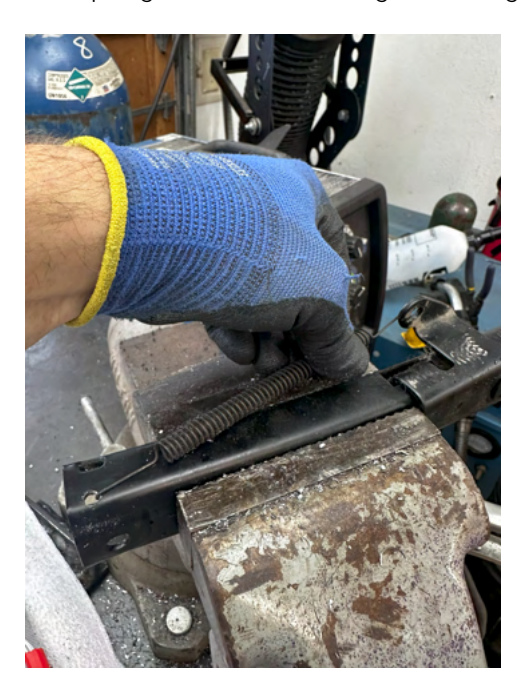
NOTE: Spring Orientation is WRONG here – need to twist 180 degrees – see photos below for verification!

6. Next, stretch/extend the front of the spring and while twisting it 180 degrees, hook it onto the detent arm.